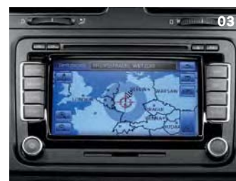
03 RNS 510 touch-screen navigation/DVD radio system.

When it comes to in-car entertainment systems and communications packages, those looking to install a technologically advanced or upgraded system are spoilt for choice. Whether you require concert hall acoustics or the latest navigation system, these factory-fitted options provide state-of-the-art technology and connectivity. Choose the system that best meets your needs, then sit back and enjoy the benefits.