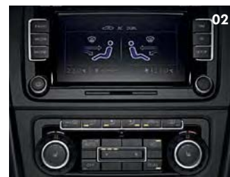
02 2Zone electronic climate control and RCD 510 touch-screen radio system.

The importance of comfort and convenience cannot be over-emphasised. Choose from this range of factory-fitted options to create an interior that meets your individual needs, and makes life just that little bit more comfortable and convenient. From 2Zone electronic climate control to a front centre armrest, from a sunroof to a Winter pack, these essential luxuries are designed to help you relax and take the stress out of driving, adding not only a touch of luxury, but also providing invaluable practical assistance.