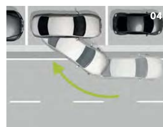
04 Park Assist.

Safety and security have to be a primary consideration, for only when you are feeling totally safe and protected can you completely relax. Whether you are looking to ensure the safety of your passengers, enhance rear safety or make life just that little easier, this range of safety and security features will help you protect passengers and make your Golf more secure. For example, activate the Park Assist parallel parking system while driving past a parking space with the indicator on, and ultrasonic sensors will detect if the space is suitable and if so, inform you. Select reverse and the assistant automatically takes over the steering, you use the clutch, brake and accelerator to ease into the parking space with an audible warning to notify you of your distance to the vehicle behind.