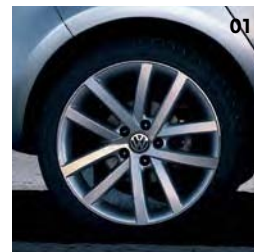
01 'Vancouver' 7½J x 18 alloy wheels.

Add a touch of style and personality with this great choice of alloys. Alloys add a distinctively sporting look to your car, carefully chosen to enhance the exterior styling of every model, these options give you plenty of opportunity to express your individuality and transform the appearance of your Golf.